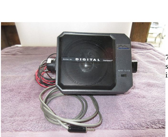
7. Am-Com Digital ClearSpeech DSP loud speaker, 12vdc. Excellent condition. 1 image $50